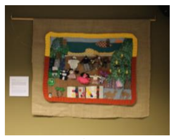
World Family, arpillera from San Sebastian, Basque Country, Women's Empowerment Group, Red Cross, Guipuzcoa.

Workshop held as part of the activities during the exhibition: 'Sewing Peace: Conflict, Arpilleras, Memory', 2016