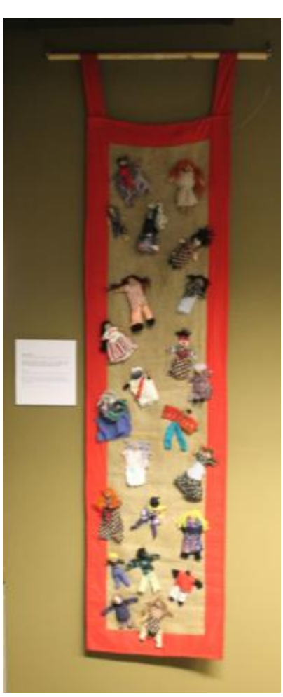
Untitled , Arpillera from San Sebastian, Basque Country

Workshop held as part of the activities during the exhibition: 'Sewing Peace: Conflict, Arpilleras, Memory', 2016