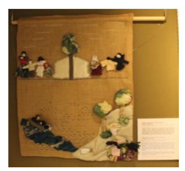
Welcome Refugees, identifying with these individuals.

Arpillera from Guernica, Basque Country. Collective piece made during a workshop held as part of the activities of the Arpillera International Forum , 2016 .