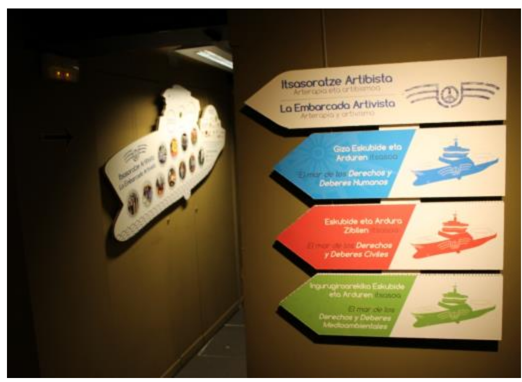
Partial view of the exhibition on display

Urdaibai is an arpillera about Guernica, Basque Country. It was made by participants of the Women's Arpillera Workshop Group at the Guernica Peace Museum that took place as part of the activities within the exhibition entitled, 'Sewing Peace: Conflict, Arpilleras, Memory", 2015-16'