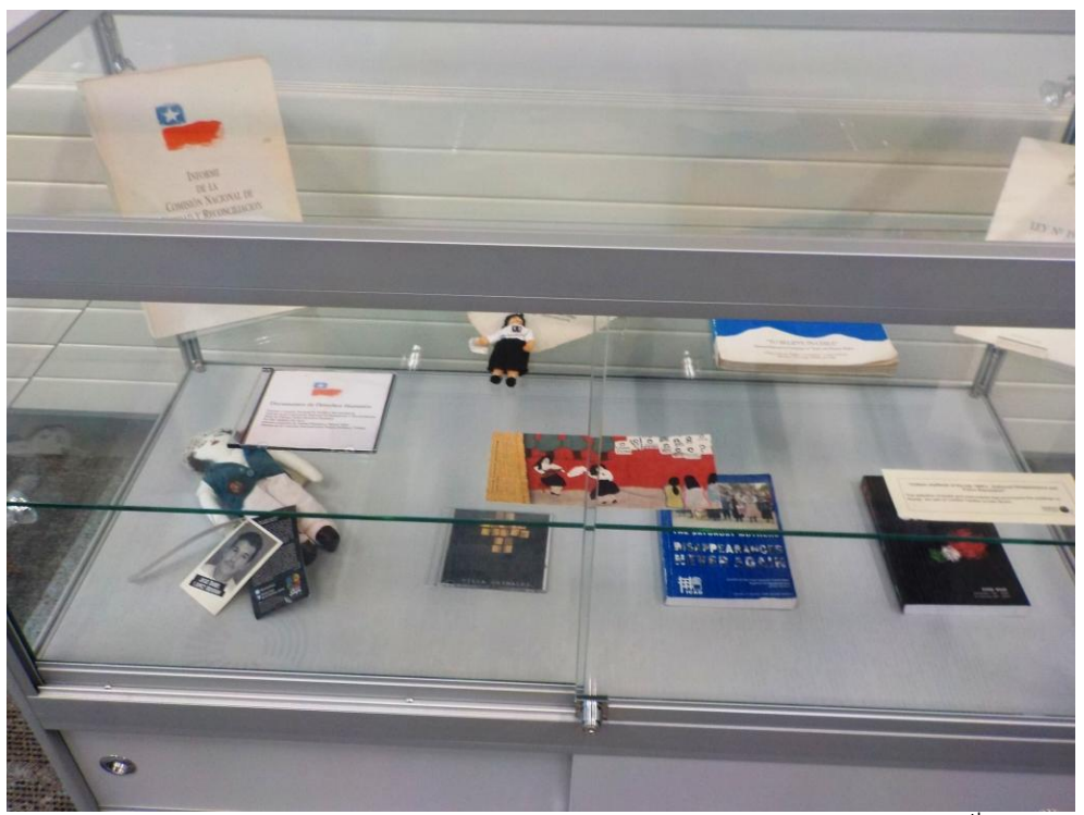
The display case with related memorabilia – added by Roberta Bacic on 27<sup>th</sup> September 2022.