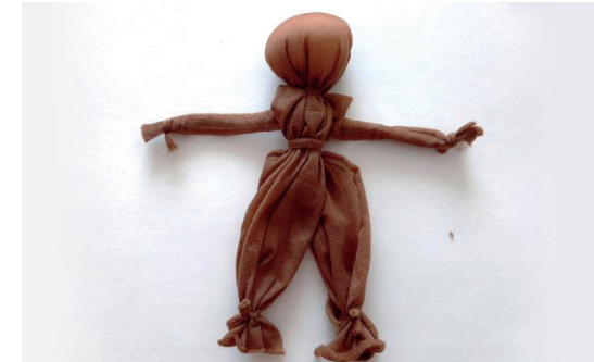
Step 3 Make arpillera doll body