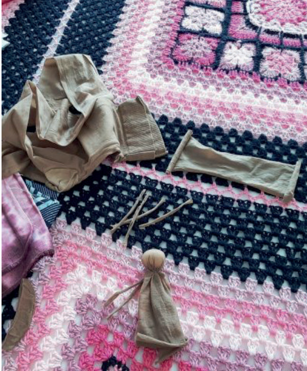
Step 1 Collect Materials