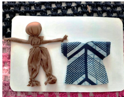
Step 4 Make your arpillera doll's clothes