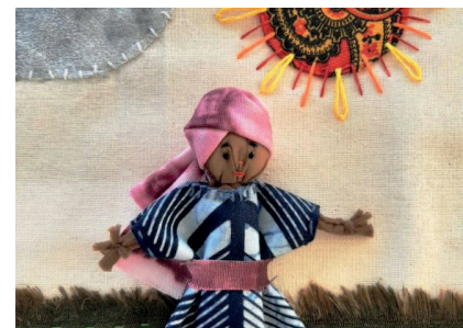
Step 8 Add details to the arpillera with stitching