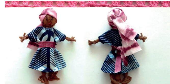
Step 5 Dress arpillera doll (front, back)