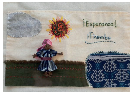
Step 7 Stitch your arpillera together