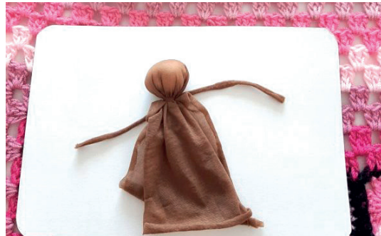
Step 2 Make arpillera doll head