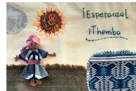
Step 9 Final arpillera, ready to hang